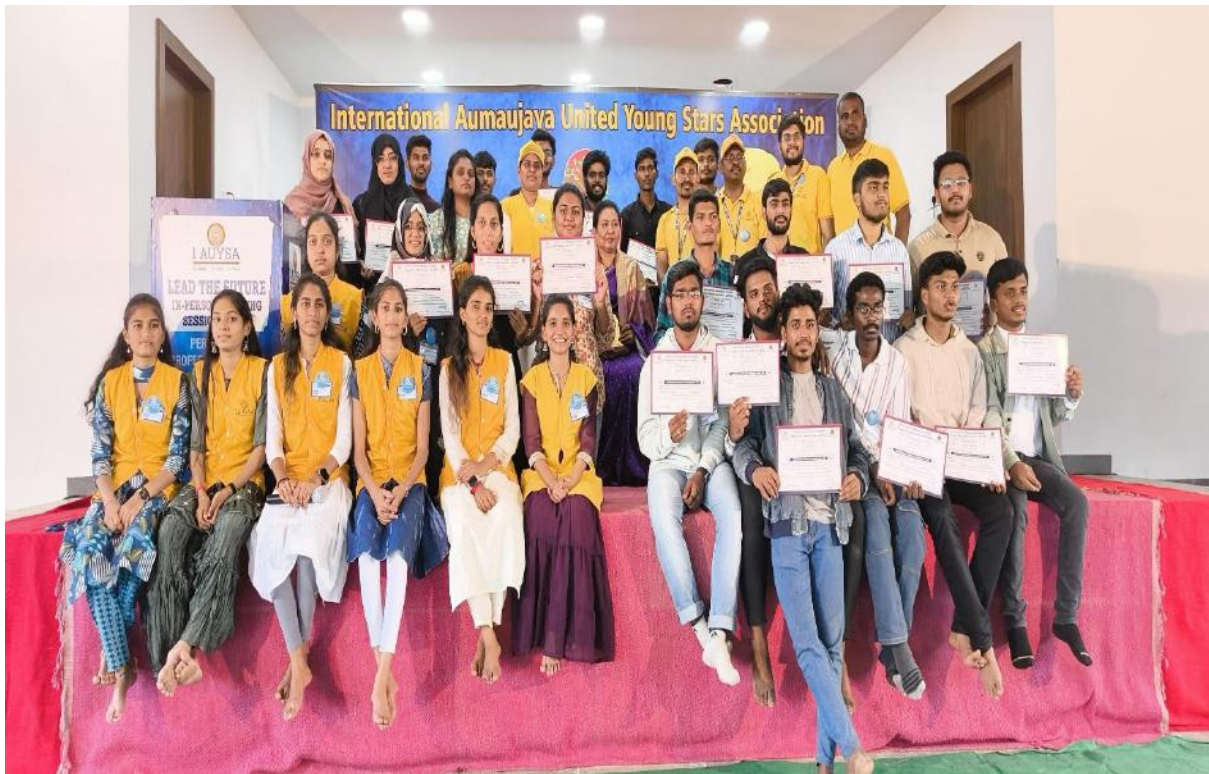
Photo Gallery of the program