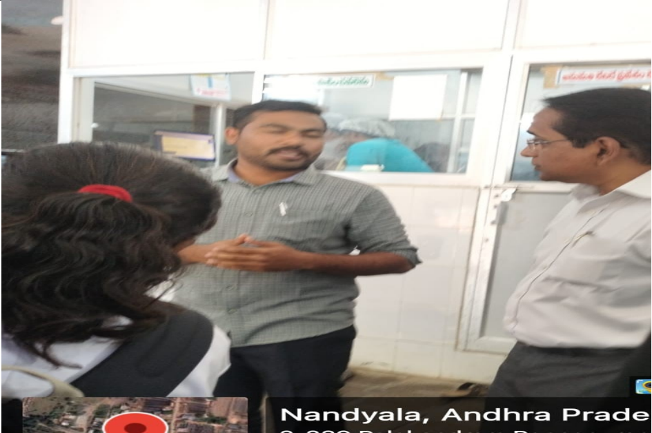
Nandyala, Andhra Prade